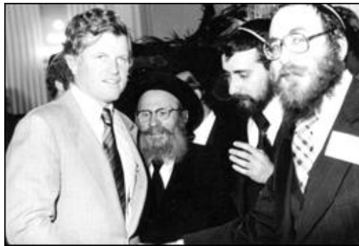
Senator Ted Kennedy

...Visits followers of the extremist Orthodox Lubavitch Movement.